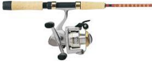
Example of a Spinning Rod & Reel